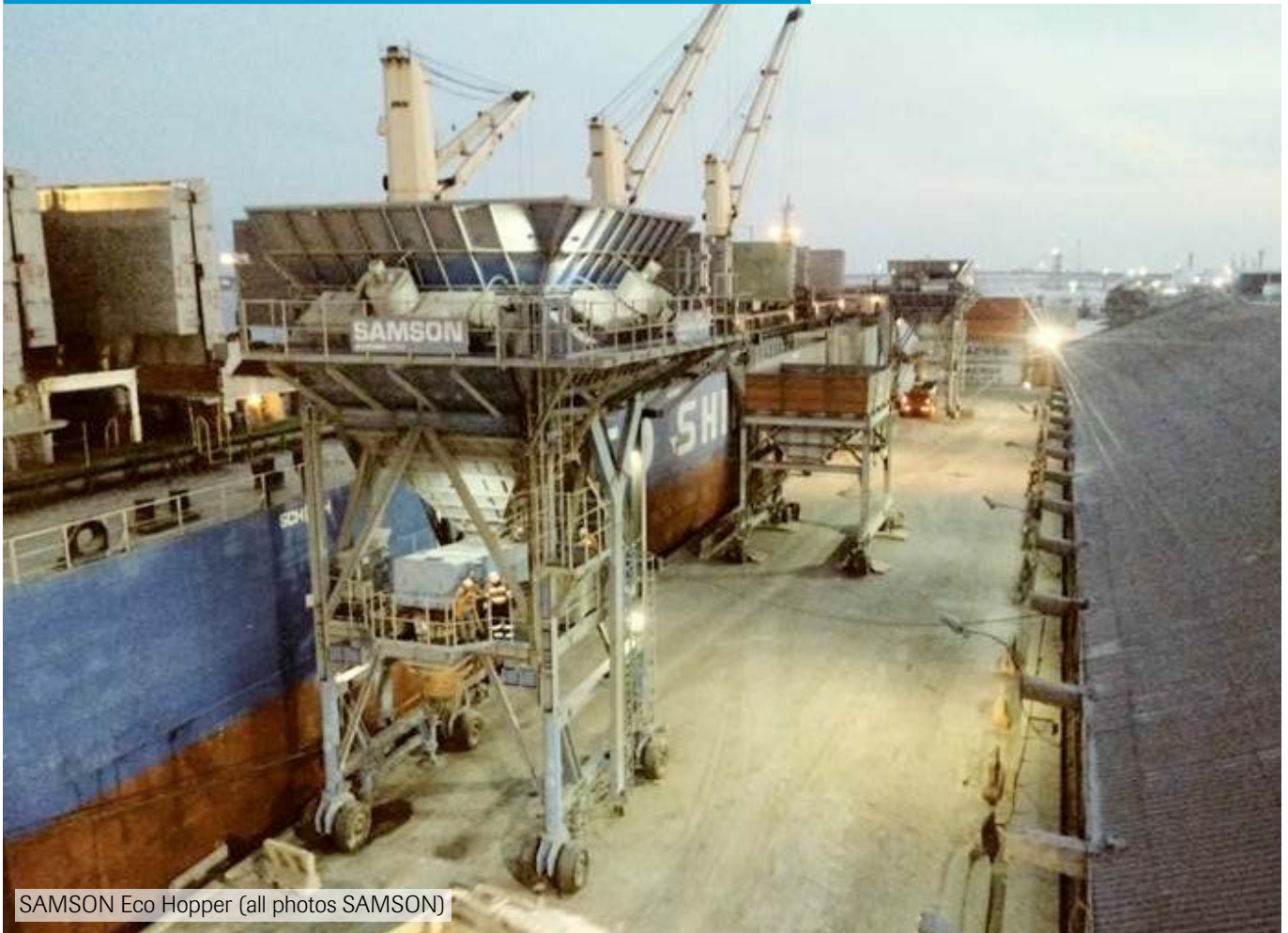
SAMSON Eco Hopper