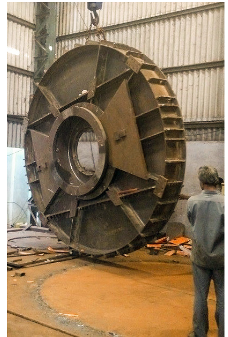
CENTREX® CTX-AV in the workshop.

connecting the inner cone with the silo wall. This alternative with external drive and stationary cone offers ideal conditions for applications involving a high torque and requiring easy maintenance.