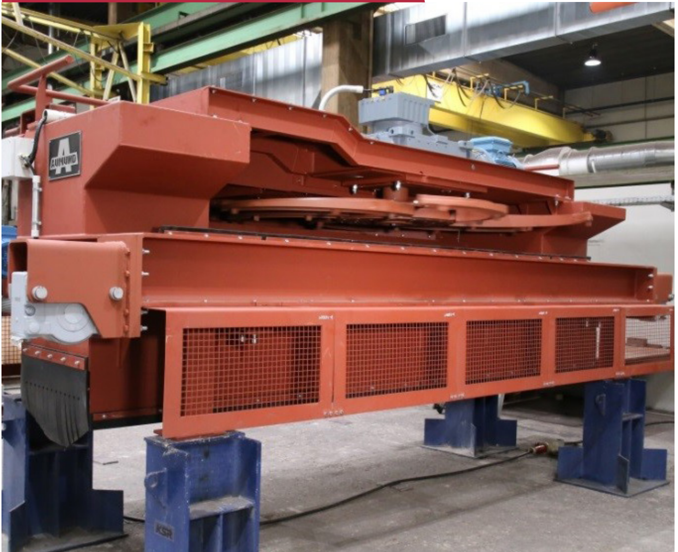
AUMUND Rotary Discharge Machine type LOUISE BEW-FL (Example)